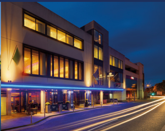
ATHLONE, CO. WESTMEATH