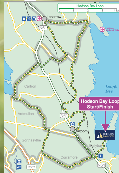
THE HODSON BAY LOOP (Green Heartlands Cycle Route)

Terms and Conditions Apply | Subject to Availability Bike hire is not included with this package but is available to hire at several locations around Athlone. A nominal parking/entrance fee may apply at Lough Key.