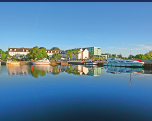
ATHLONE, CO. ROSCOMMON